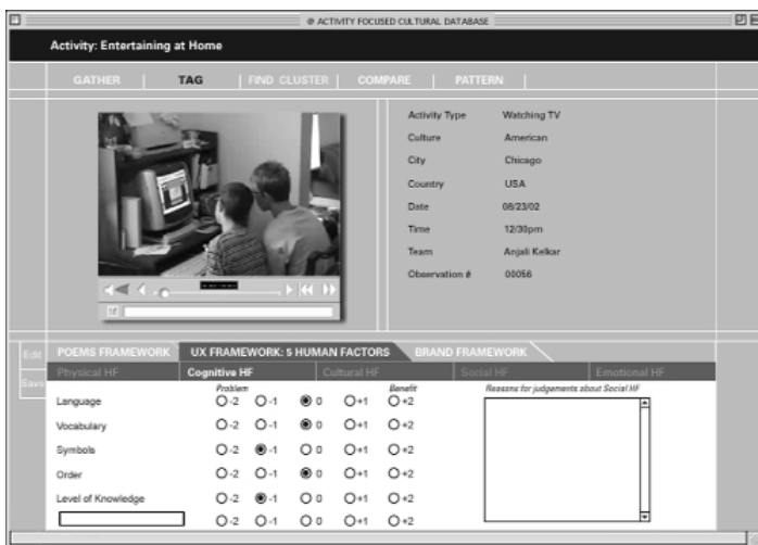
Figure 3. Tag observations with user-experience frameworks.

Another step in the process is tagging individual observations within a comprehensive framework, like POEMS (people, objects, environments, messages, and services). Possible keywords for a specific observation are listed under the framework categories. In this screenshot, a video observation about children playing on a computer in a Chicago home is being tagged to the appropriate keywords of the POEMS framework. The researcher can also enter more-detailed notes in pop-up windows about the observed behavior as the tagging proceeds.