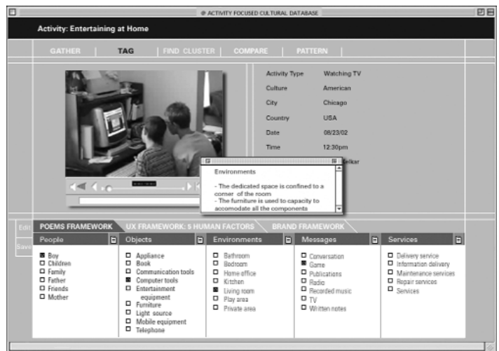
Figure 2. Tag observations with POEMS framework.

In this step of the process, software tools allow researchers to log observations collected from the field. These observations might come from video, still, and disposable cameras, field notes, personal digital assistants, and other tools. Individual observations, for example, video clips, can be viewed and edited using the video control panel. Languages unfamiliar to the researcher can be auto-translated and displayed as a scrolling text on the video panel. Data fields allow the researcher to enter the relevant reference data about each observation, such as date, time, location, and others. Later, searches can be performed based on these reference data to facilitate active browsing. The active video clip shown here is an observation about children playing computer games at a home in Shanghai, China. The lower strip of images represents other already-logged observations in the form of video clips, still images, and field notes, any of which can be activated at any time.