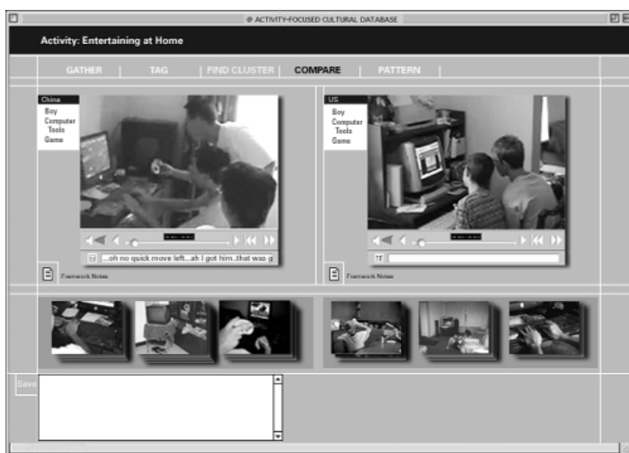
Figure 5. Compare clusters of observations.

Another tool facilitates comparison between the clusters. Here two clusters of video clips can be simultaneously analyzed to understand similarities or differences. In this example, the activity is children playing computer games at home in two cultures—China and the US. Behavioral differences between them while they engage in this activity can be understood visually and simultaneously. Such comparisons are valuable to help companies fit their innovations to specific local markets. As in the other steps, insights about cultural differences can be noted and viewed in the text field.